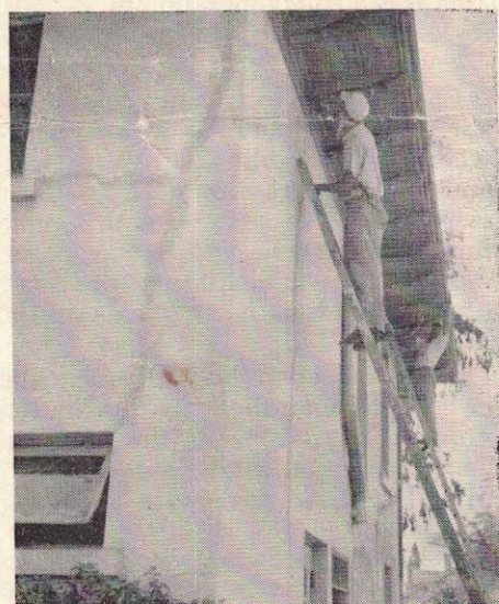
Face Lifting for Ad-Building

Hours later we sunbaked ones trudged exhausted back on up the hill to the car, our pockets bulging with shark's teeth and old bones. It was the end of a hilarious day in the interest of science and a new-born fossil lover.