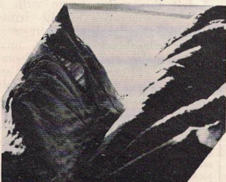
TRAVELERS: CAN YOU NAME THIS? (FOR ANSWER SEE PAGE SIX COLUMN THREE)

Remember, free admission! Free refreshments! FREE DANCE INSTRUCTION! Opportunity knocks!